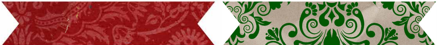
Christmas Tags: Vintage Santas